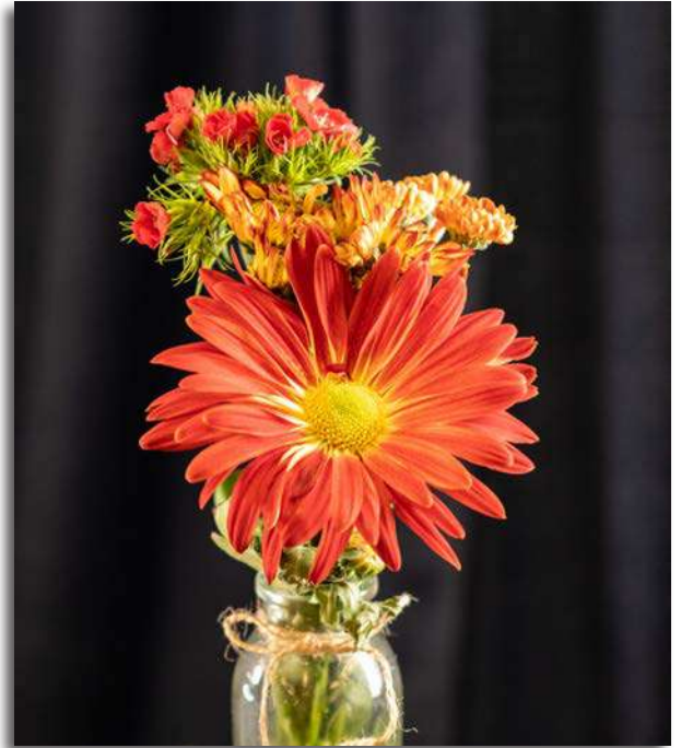
HM "Gerbera and Friends" Dick Light