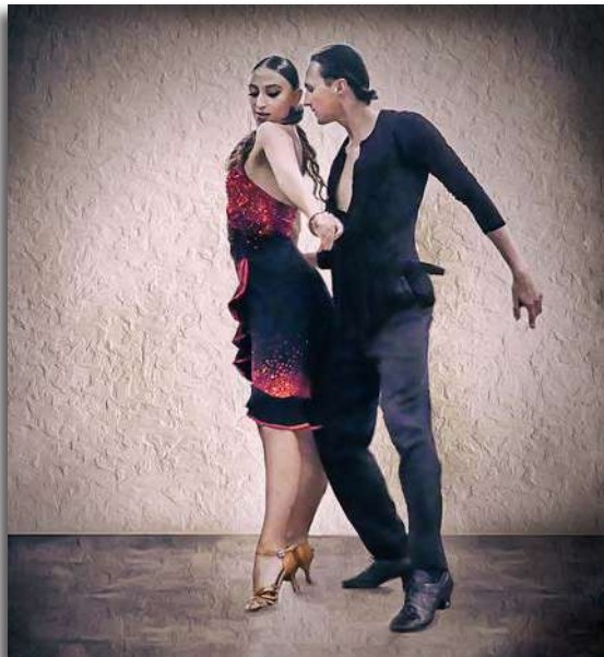
Top Peninsula Dance Studio instructors demonstrate the rumba. Printed on metal: the material adds depth and enhances the sparkle of the crystals on the dress.