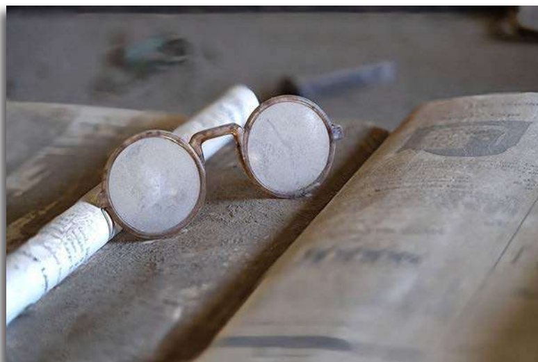
3 rd "Left Behind" Carol Silveira