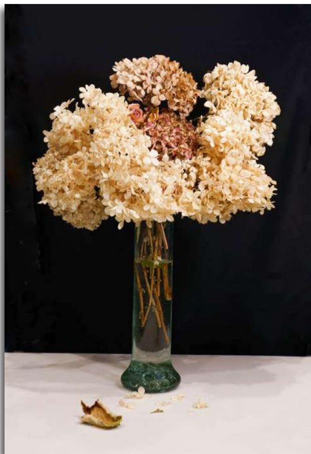
3 rd "Yesterday's Bloom" Carole Gan