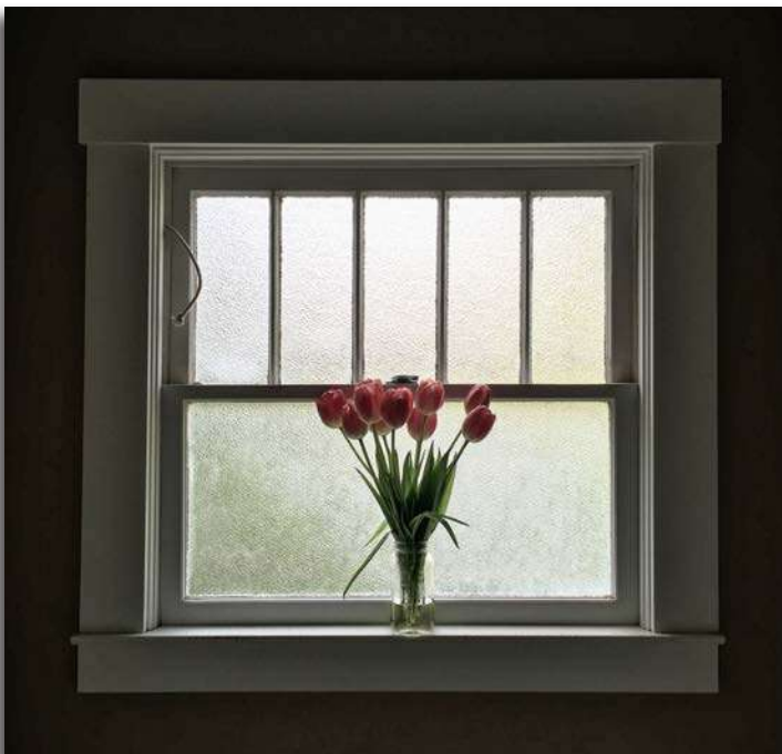
3 rd "Tulips in the Bathroom Window" Patricia McKean