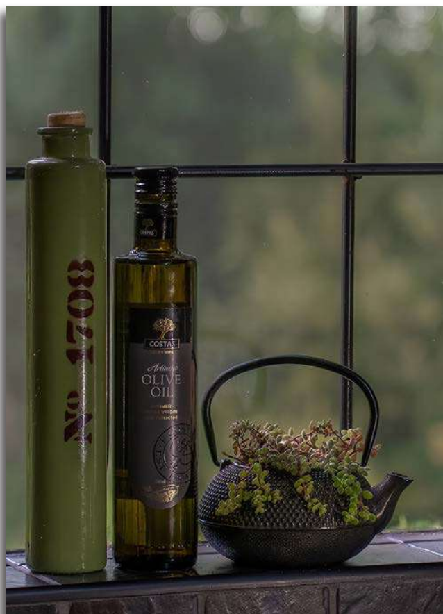
HM "Kitchen Windowsill" Julie Chen