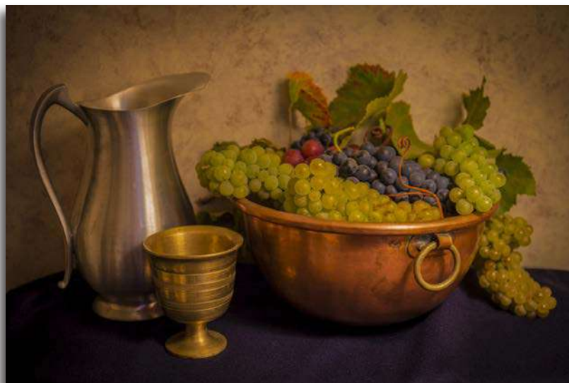
1 st "Grapes" Joni Zabala