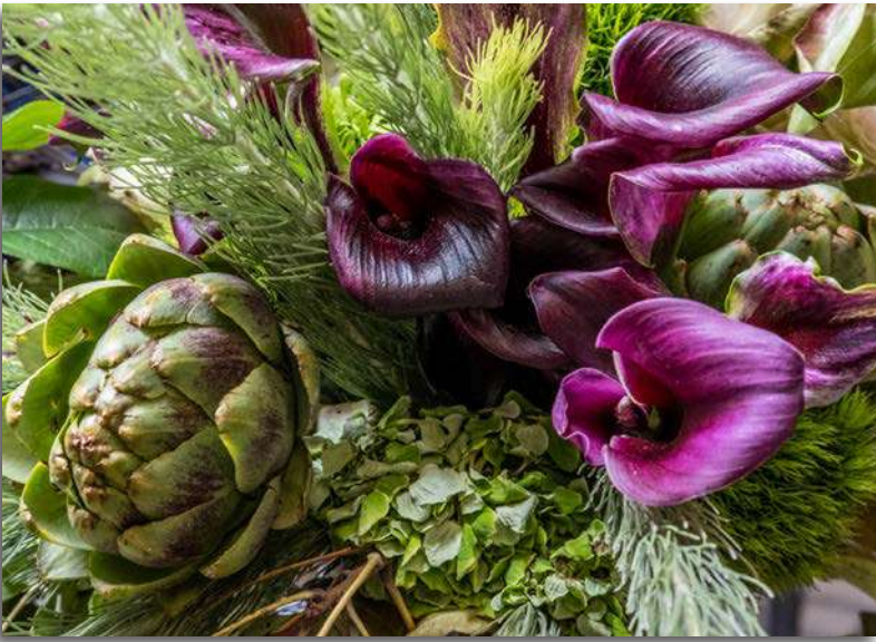
HM "Purple Calla Lily Centerpiece from Castroville" Dick Light