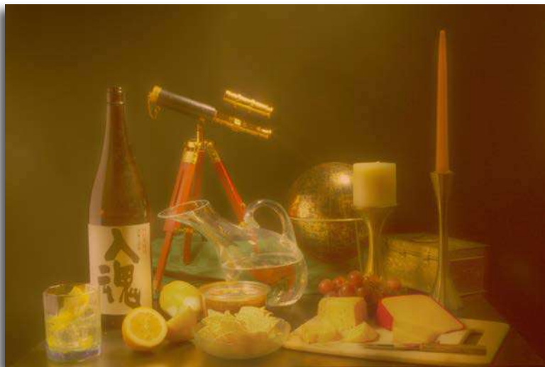
2 nd "Cool Subjects Sake Lemon Grapes Cheese Telescope Globe Candles and Chips Salsa Still Life" Brian Spiegel