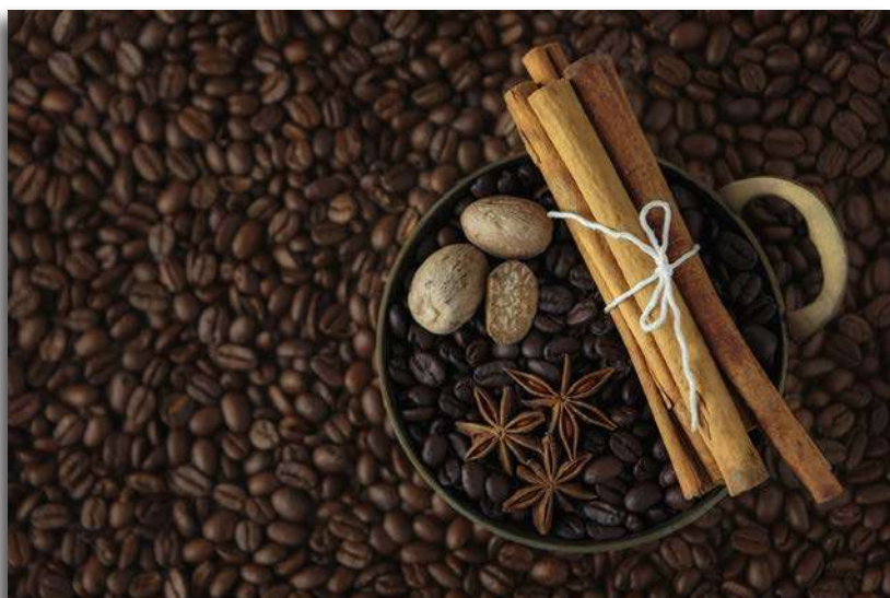
HM "Coffee, A Simple Pleasure" Denice Loria Woyski